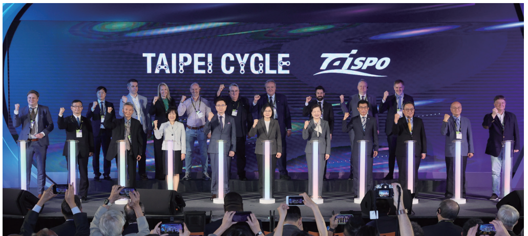
TAIPEI CYCLE & TaiSPO聯合開幕典禮-貴賓合影。

Foreign and domestic buyers visiting the 2023 TaiSPO expo to view the newest products and solutions at the expo.