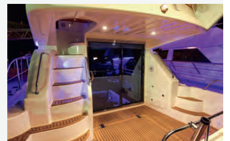
The H.Yacht L390 has been given an upgrade for its first TIBS appearance